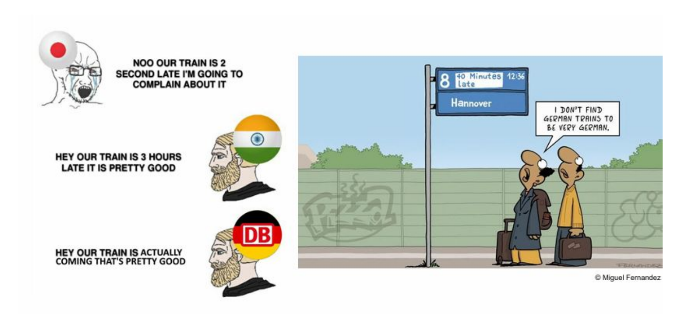
Be aware of common delays!